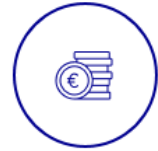
HIGH COST OF PRODUCT RECALL