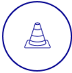
INCREASING FREQUENCY OF LIABILITY LOSSES

In an increasingly complex world, multinational companies with more than 5000 employees have to face new challenges: