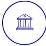
MORE AND MORE REGULATIONS