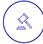
DEVELOPMENT OF CLASS ACTIONS